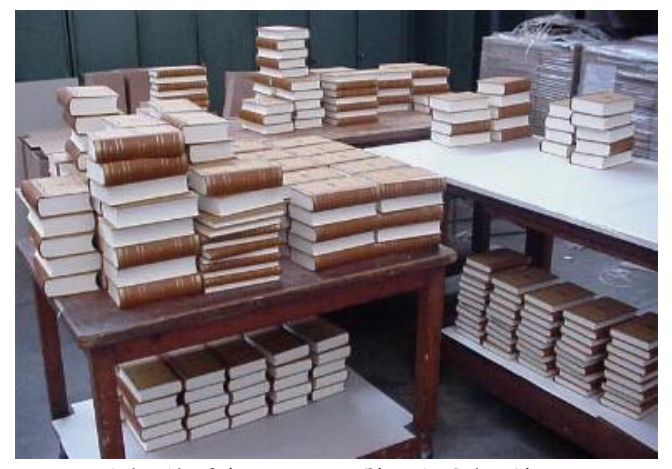
A tiny bit of the great mass.

The packing materials had been organized and all was ready.